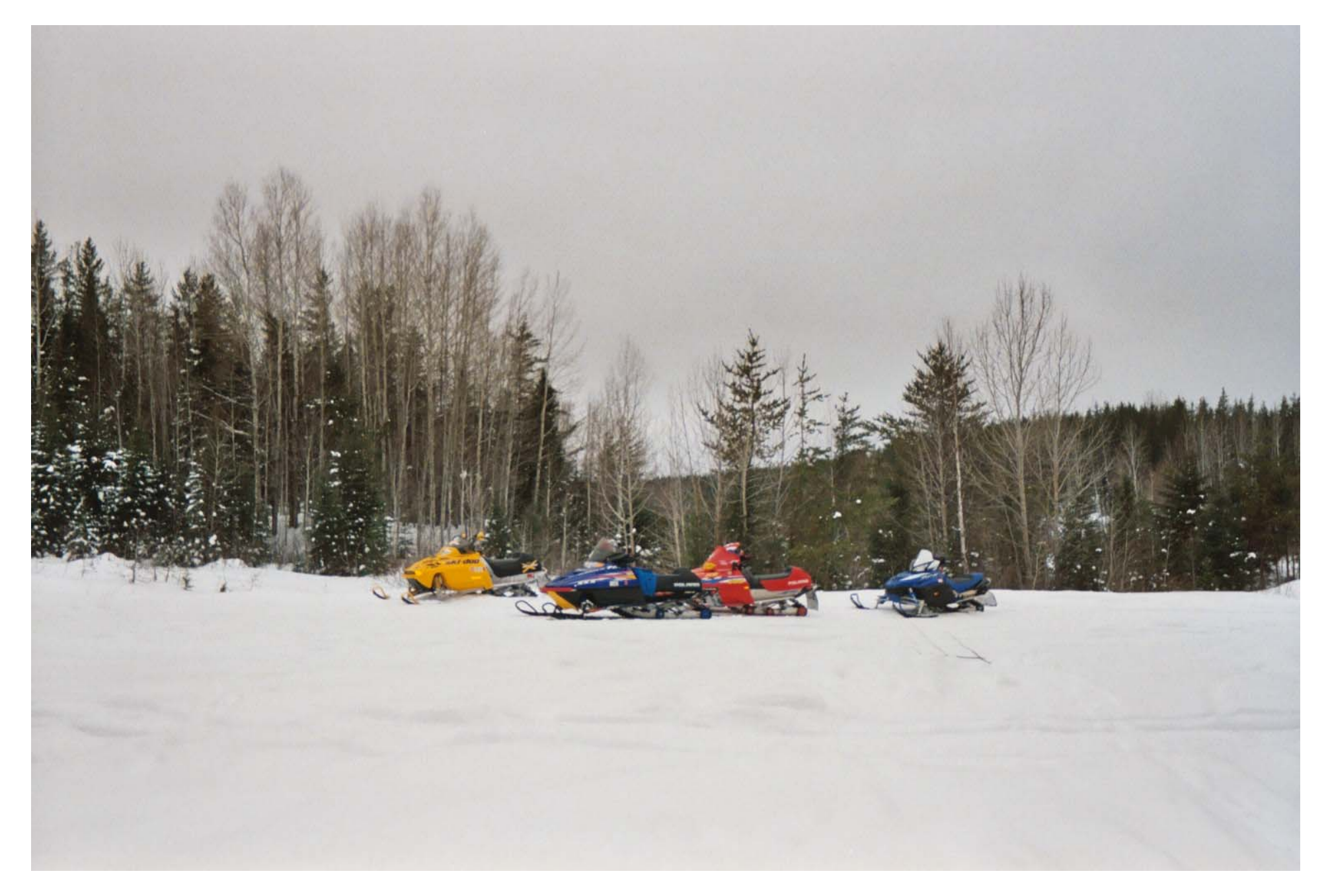
Sleds Parked East of Sturgeon River February 1, 2003