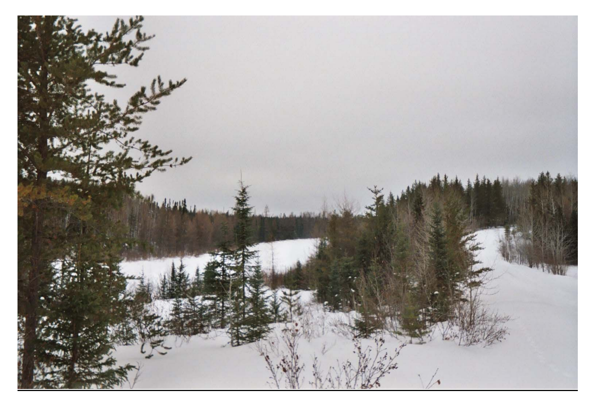
<u>Trail View of Sturgeon River</u> February 1, 2003