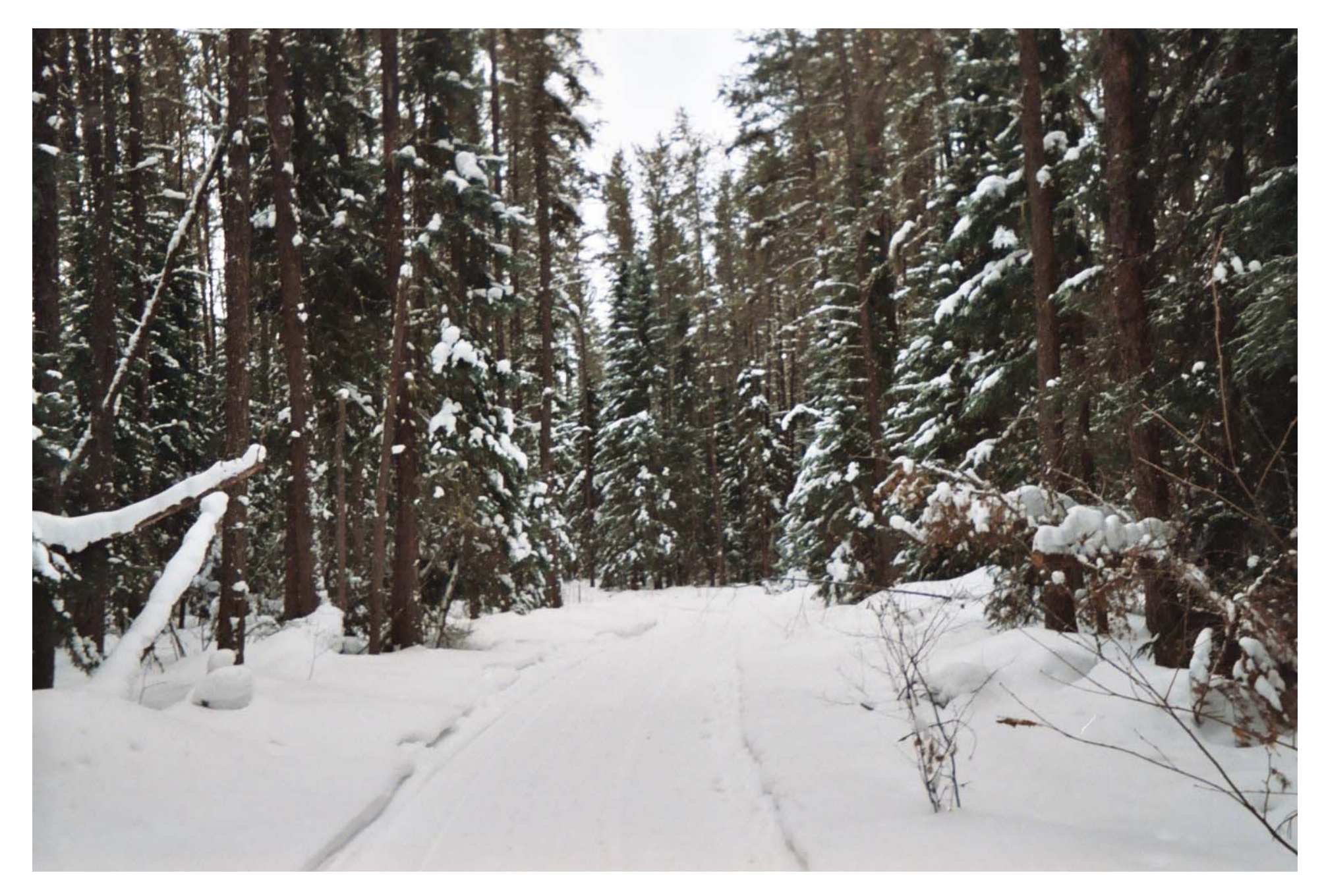
W-Trail Behind Pasha Lake February 2, 2003