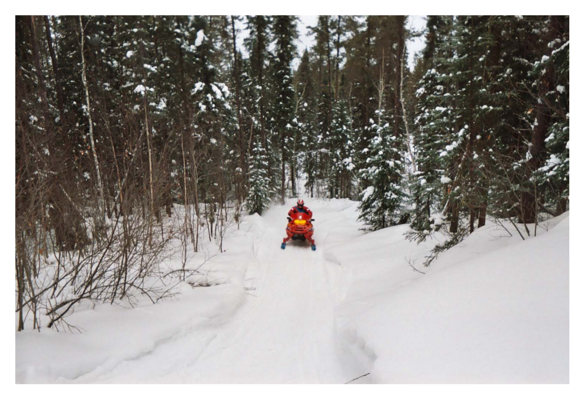
Brad on W-Trail February 2, 2003