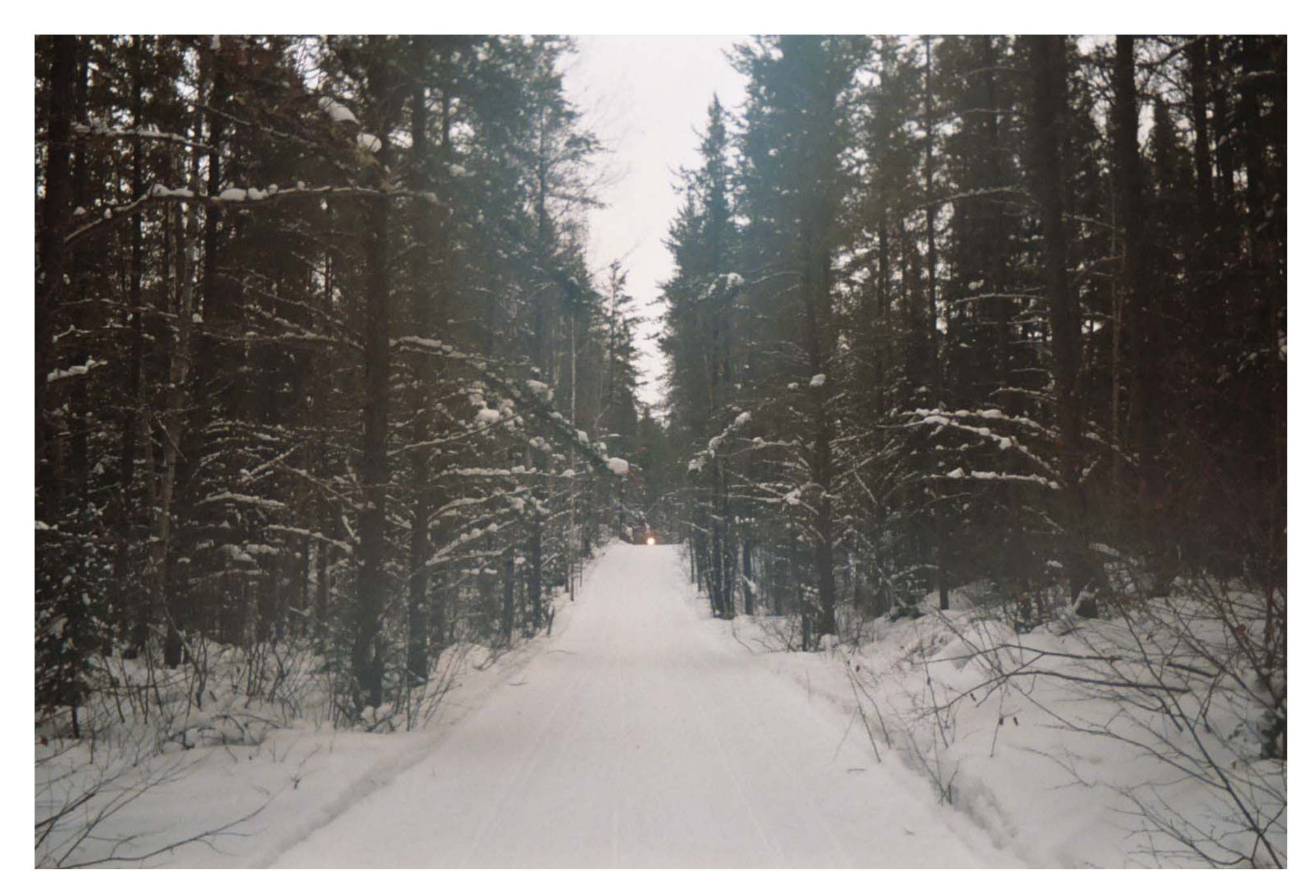
Trail to Geraldton February 1, 2003