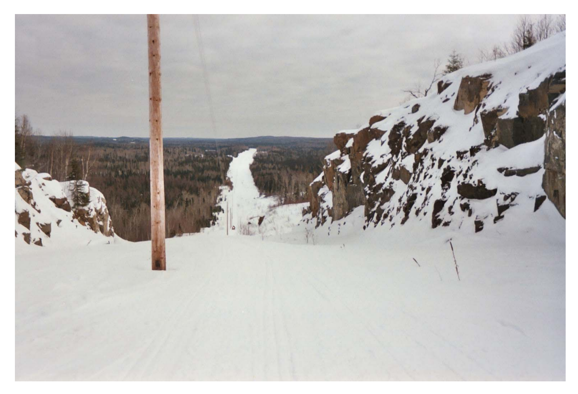
<u>Trail From Jellicoe to Beardmore looking East</u> February 2, 2003