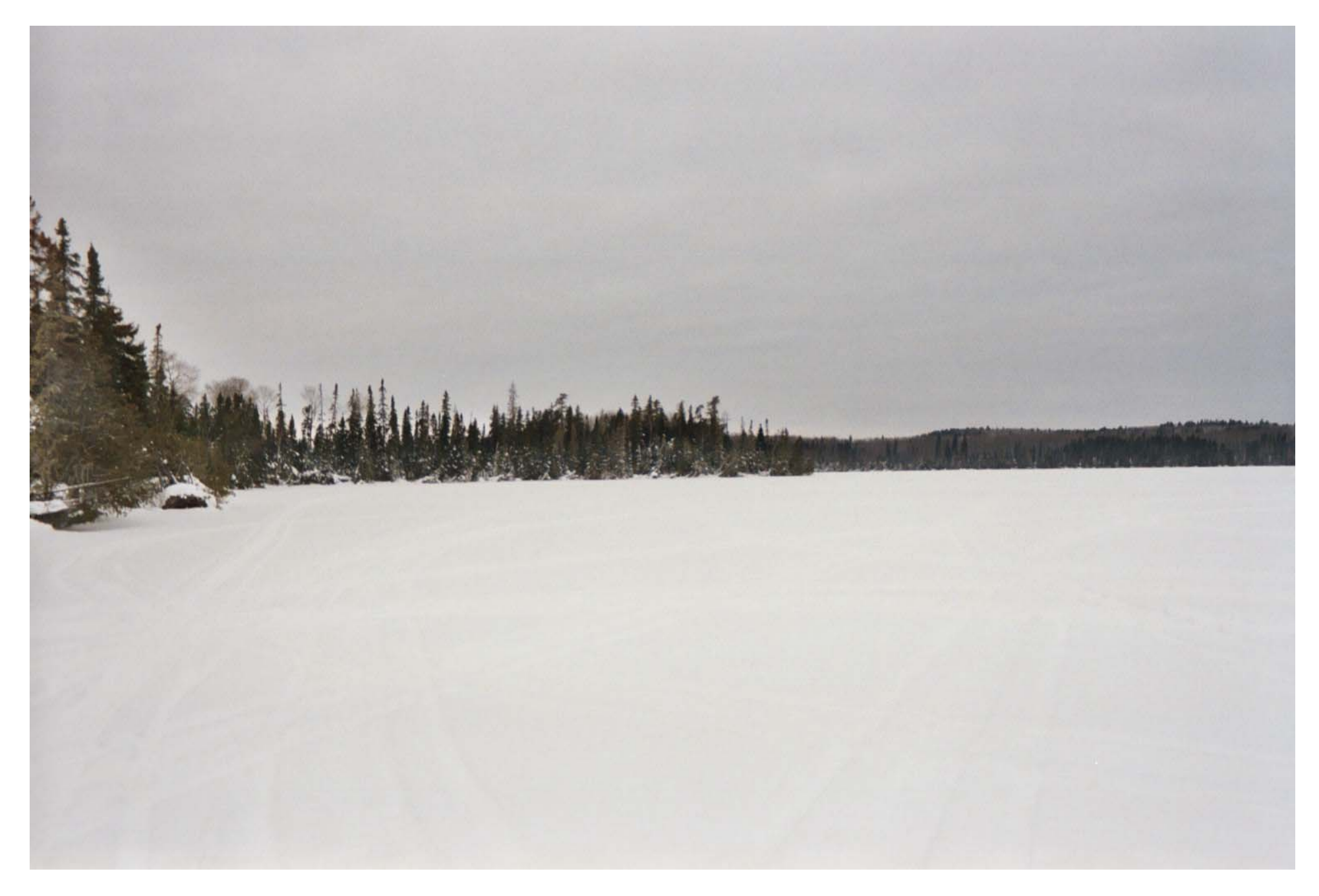
Fresh Tracks on Pasha Lake February 1, 2003