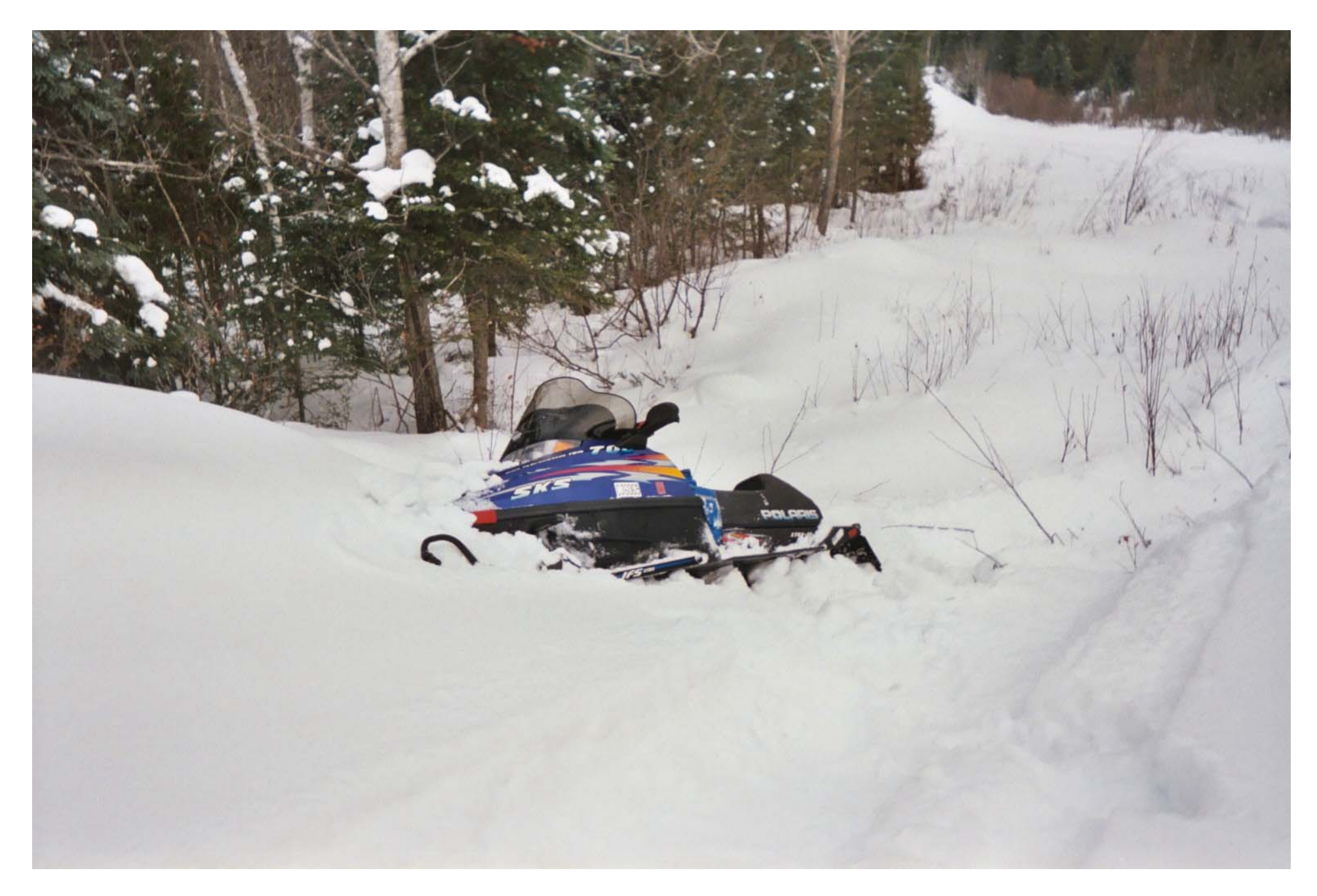
Why we were waiting for Bob C. February 2, 2003