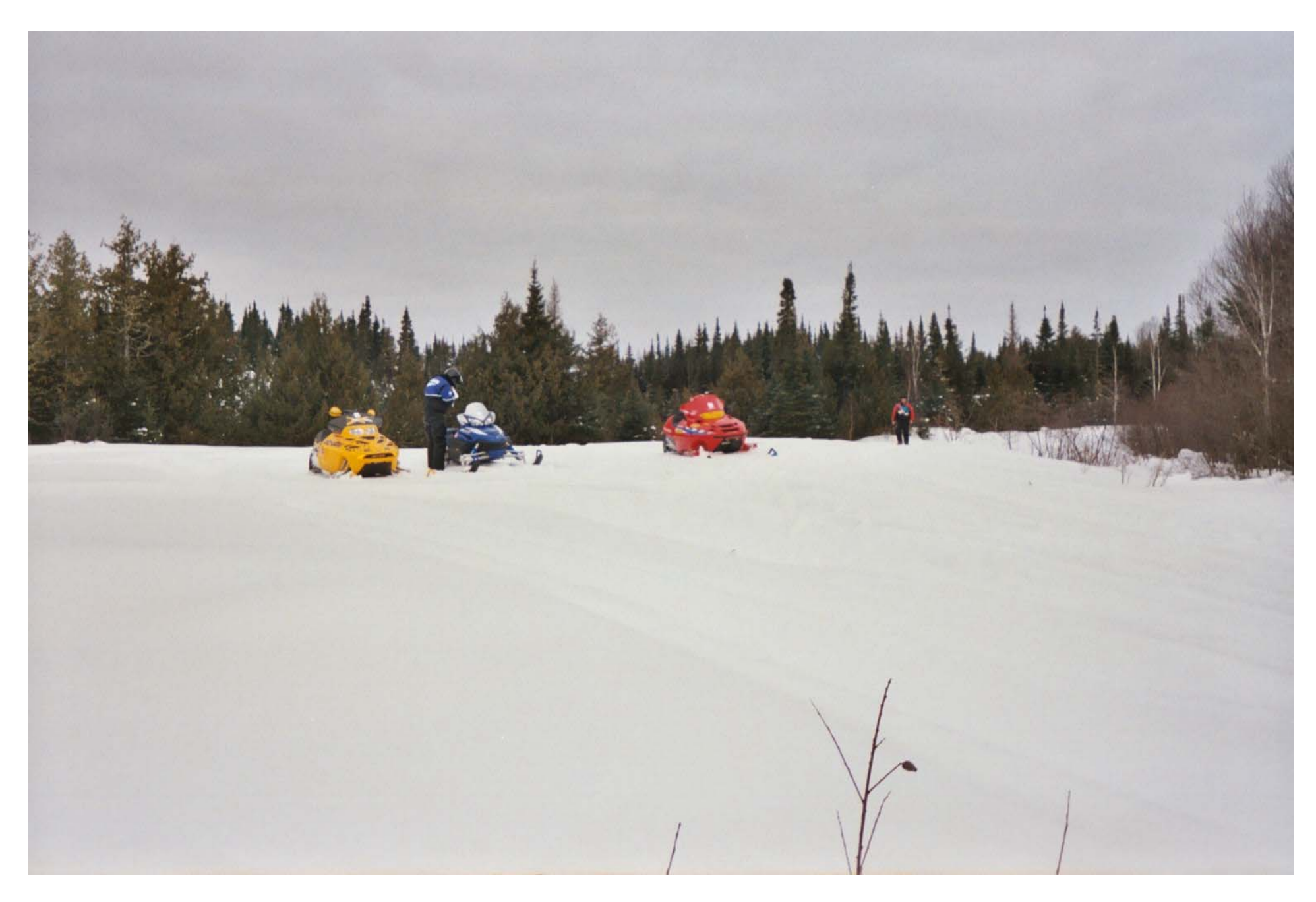
Waiting for Bob C. February 2, 2003